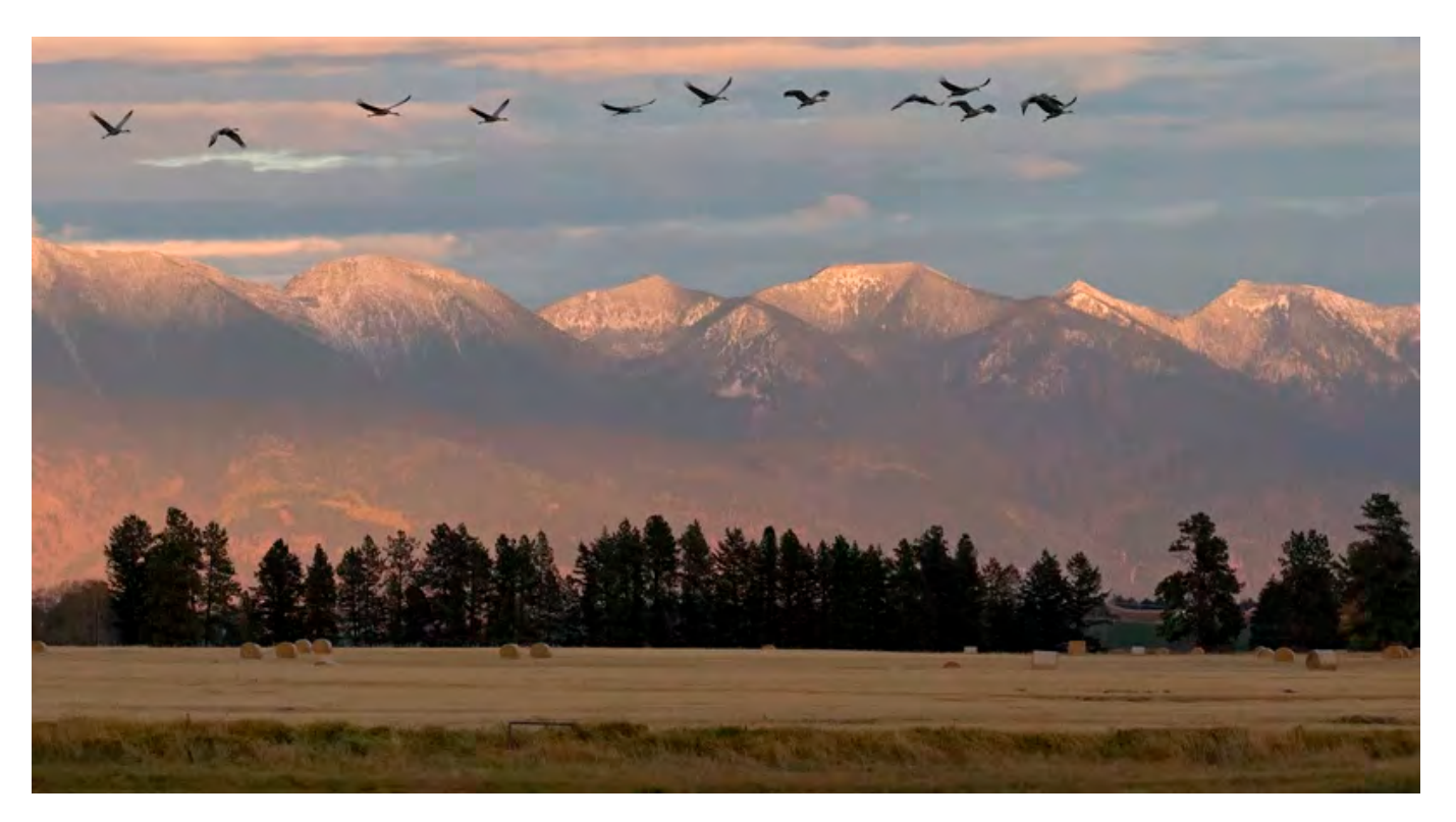
A flock of sandhill cranes flying in Kalispell, home to Three Rivers Bank in Montana.

King says Three Rivers Bank has more than 50 employees, many of them hired only to deal with complying with current rules.