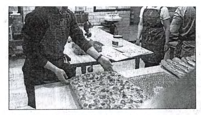
Uptown Hearth staff makes focaccia for their guests.